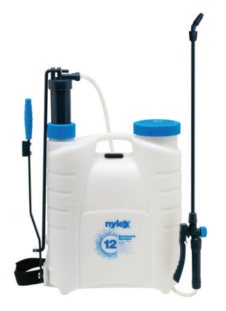
Backpack Sprayer 12L